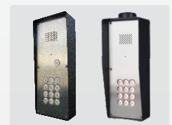
Options: with Service Button, complete stainless steel, with antivandal antenna on top, ...