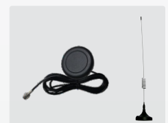
Outdoor GSM antennas (antivandal, patch, magnetic)