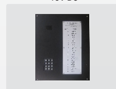
Custom design front plate - option