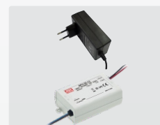
Ext. power supply 100 - 230V AC/ 15V DC